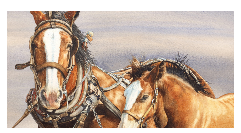
OCT 3 - NOV 7

The Art of Everyday Nature (call to artists!)