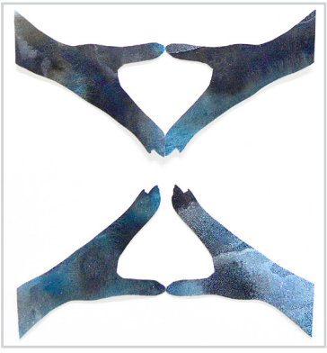
AUGUST 22 - SEPT 26