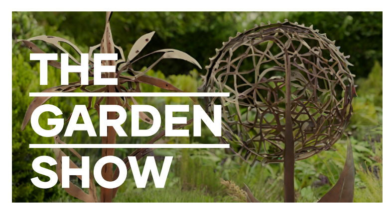
THE GARDEN SHOW