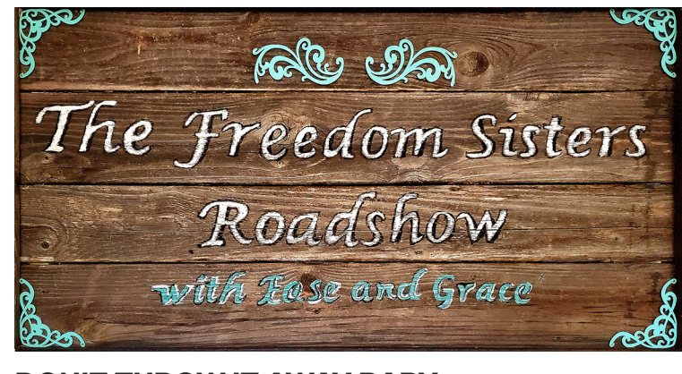
DON'T THROW IT AWAY BABY MAY 30 - JULY 23 Up-cycled Functional Art from the Freedom Sisters Road Show