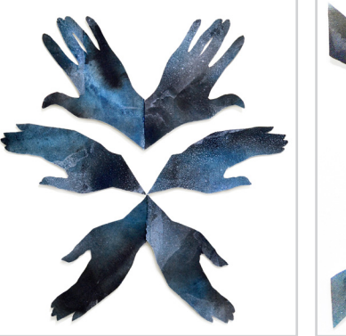
NIKA BLASSER Swimming in Saltwater